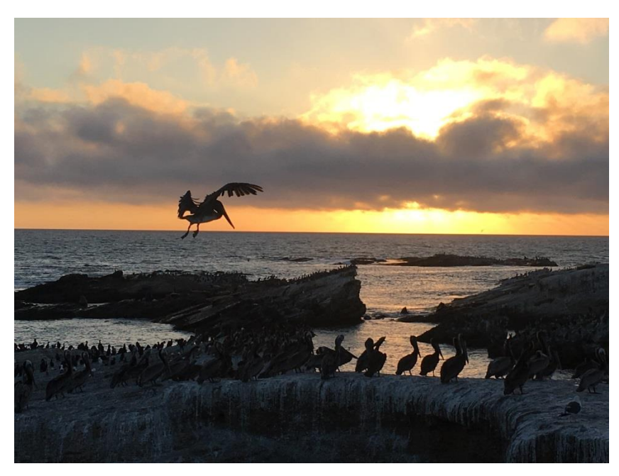
Brown Pelican sunset