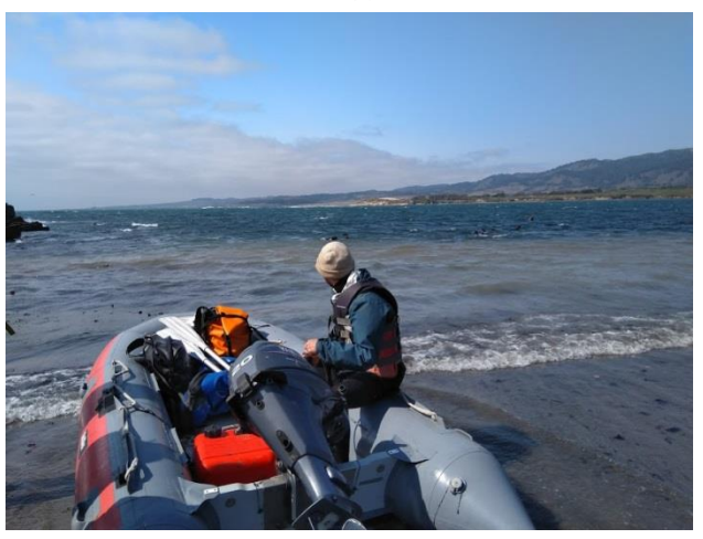
Boat trip across channel

To apply, please send a cover letter with a description of why you are interested in the internship, a resume with pertinent school, job, or volunteer experience, and at least one